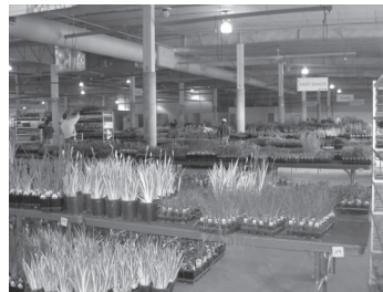
Setting up for Spring Affair