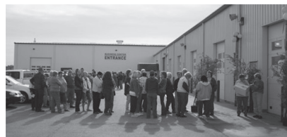
Customers in line Saturday morning