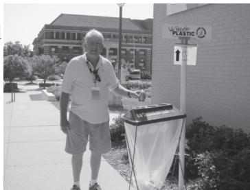
A Special Olympic volunteer recycling outside Kimball Recital Hall

Recycling and composting 50% of the waste was a goal for the event including Zero Waste Events at the Opening and Closing Ceremonies. We had recycling containers everywhere on campus and volunteers willing to help. The event recycled 23, 187 pounds and we exceeded our goal of 50%.