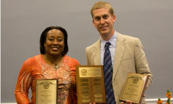
Bruce Kendall Award Winners