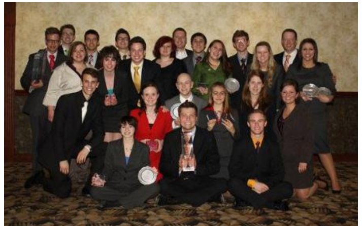
2011 Speech & Debate American Forensics Association National Individual Events Tournament Team