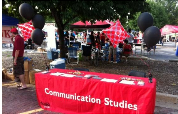
Big Red Road Show

Department. This holiday season, we have decided to give back to the Lincoln community by sponsoring the Hope Holiday Drive, in which we will collect as many items as we can to donate to the people of the Voices of Hope