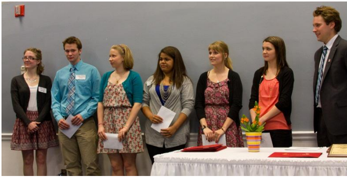
Some of our top undergraduate Communication Studies majors were inducted into the UNL Lambda Pi Eta Chapter.