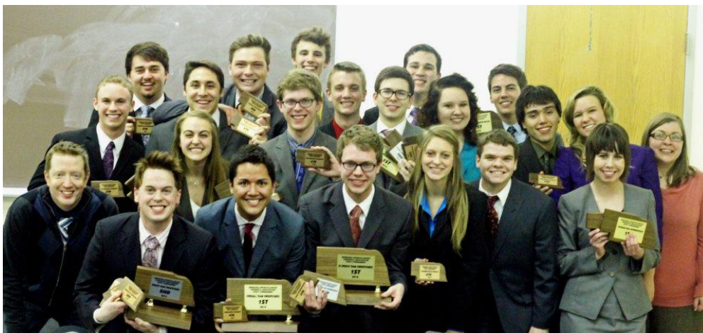
The UNL Speech & Debate Team celebrated their fourth consecutive victory at the Nebraska Intercollegiate Forensic Association's State Tournament..