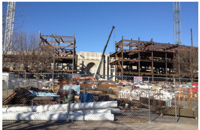
Construction around Memorial Stadium outside Oldfather.