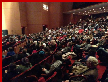
An audience of 1,023 watches UNL Speech & Debate take on the British Debate Team.