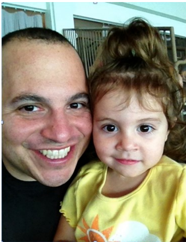
One of the "changes" since my PhD days!

Thus, the rise and use of social media by academics is something that was nonexistent during my PhD