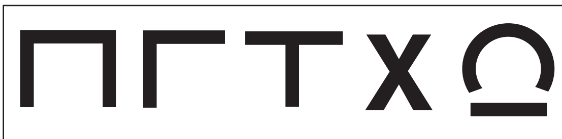
Figure 1 — Various design configurations of outdoor living barns.

Shape: typically in the form of a “U” or upside down “L” as shown in Figure 1.