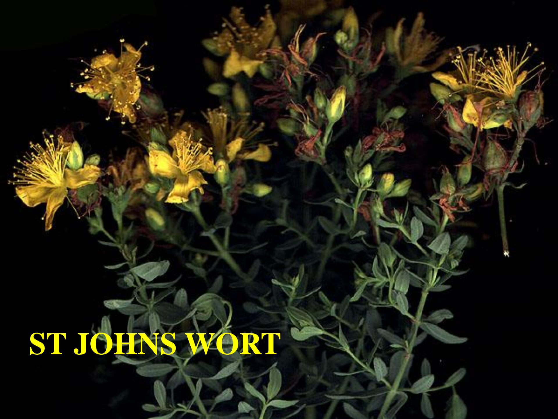
ST JOHNS WORT