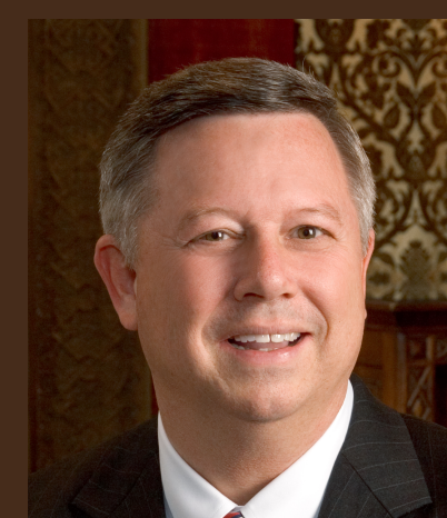
Gov. Dave Heineman