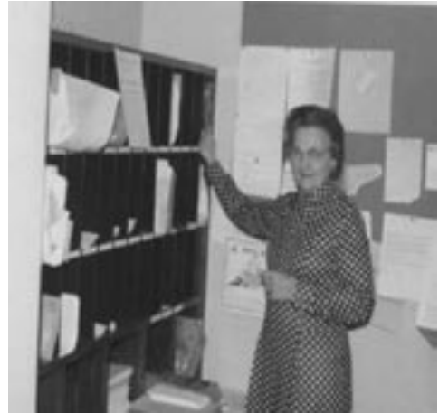
This picture was taken in her office in the Women's Physical Education Department in 1974