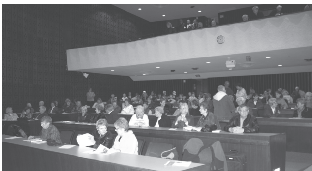
Garden Friends Annual Meeting and Speaker March, 7, 2010