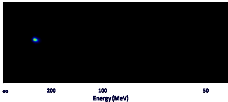
FIGURE 2. Monoenergetic, low-divergence beam, generated by 45 TW of laser power focused into a plasma with density of 7 \times 10^{18} \text{ cm}^{-3} . The energy is peaked around 320 MeV with a spread of 10%. The angular divergence of the beam (vertical axis) is 6 mrad.