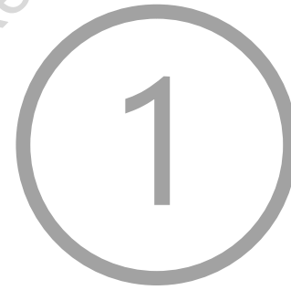
First-time Sex/ Hookups